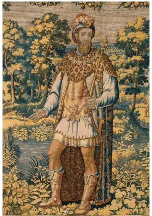
Above: One of 43 tapestries commissioned by King Frederik II at Kronborg Castle, Helsingør, Denmark

In 2003 Historic Royal Palaces commissioned a full reconstruction of the clothing worn by Queen Elizabeth I in her portrait at Hardwick Hall, Derbyshire. The most striking feature of the painting is a silk forepart or petticoat richly decorated with lively depictions of flowers, birds, sea-monsters, fruit and insects. This garment is one of the finest examples of sartorial expression of the Elizabethan fascination with the natural world. It is so extraordinary that it begs the question as to whether it was real or imagined. Motifs drawn from printed herbals, bestiaries and maps adorn waistcoats, petticoats, gloves and caps worn by the portrait commissioning elite during the 1590s and early 1600s, and many of these garments are extant in museum collections today. Nearly all of these extant examples are embroidered, but a rare few are embellished with motifs carried out with painted, or 'stained' work. This paper discussed the sources available for reconstructing the Queen's petticoat – from the rich visual imagery of her many portraits to the documentary archive as well as the archaeological evidence. It considered whether the original garment was real or imagined and, if real, whether the work was likely to have been carried out using embroidery or staining techniques. The reconstructed garment was available for display and handling.