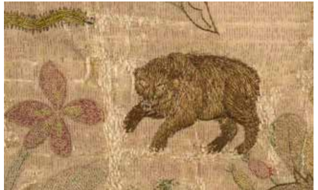
This little bear, added by the second embroiderer, has been copied from a similar engraving in Nicolaes de Bruyn's Animalium Quadrapedum , (1594).

Previous efforts to preserve the cloth during its (roughly) 400 years residence at St Faith's Church in Bacton have included a piece of supporting backing fabric, which had been stitched directly onto the Elizabethan cloth, in an attempt to hold it in place and protect it from further rips or disintegration. Unfortunately this action has meant that much of the embroidery, due to shrinkage and small changes over time, has been put under strain and pulled out of shape. Now that the backing fabric has been removed, however, the original fabric is looking much more relaxed, and has begun to ease back into something more like its natural formation. This has affected the embroidery, and already a difference in the shape of some of the motifs is discernible.