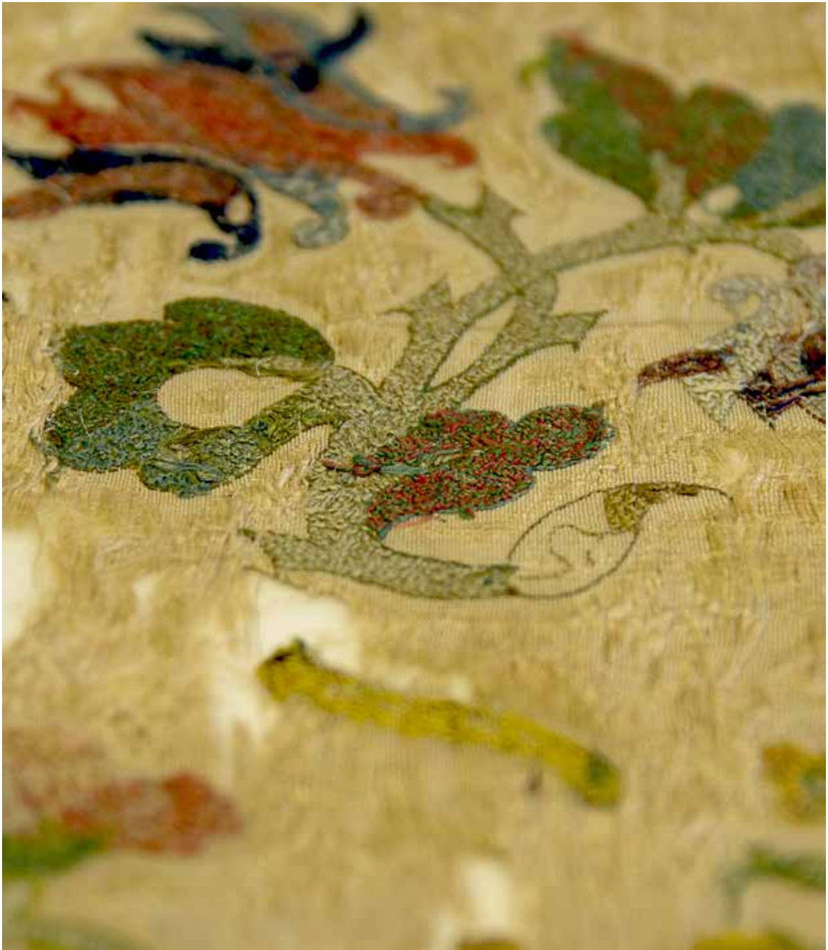
Detail of the back of the altar cloth from St Faith's Church in Bacton, Herefordshire.