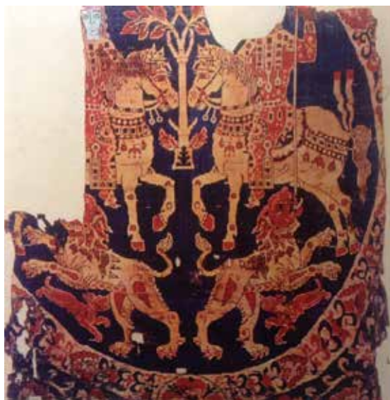
Above: Imperial Byzantine silk. Single main warp twill, eighth century, removed from the relics of St. Austremonne at St. Calmin, Mozac (Puy-de-Dome) in 1904. Museum of Historical Textiles, Lyons. Inventory 904.III.3 (27.386).

Elizabeth Kotromanic (c. 1339 - 1387), wife of Louis of Anjou, was queen consort and later regent of Hungary and Croatia. In July 1377 Queen Elizabeth commissioned a sarcophagus-shaped casket, made of gilded silver, for the body of St. Simeon the Prophet. Amongst several votive gifts that were placed inside the shrine once it was finished was the one discussed in detail. It is a shawl-shaped object, of white linen fabric (woven in plain tabby), hemmed in red silk and partially heavily embroidered. It had been laid onto the Saint's body and is believed to have belonged to the Queen herself. There are no in-depth studies of this piece and has remained unfamiliar to foreign scholars. Croatian art historians traditionally refer to it either as to Queen's veil or Queen's kerchief. Aside from the analysis of the object and its embroidered, typically Gothic profane ornaments, the talk addressed the question of its original purpose (was it really a headpiece, a kerchief, or actually an another part of the Queen's attire?) and the symbolism that can be recognized in the fact that the Queen had chosen it as her gift to the Saint.