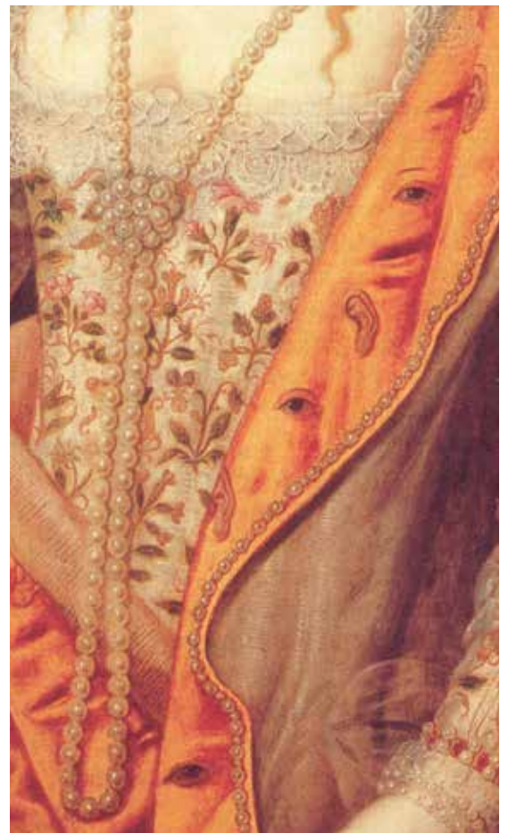
Detail of The Rainbow Portrait of Elizabeth I by Marcus Gheeraerts c1600-02 Collection of the Marquess of Salisbury, Hatfield House