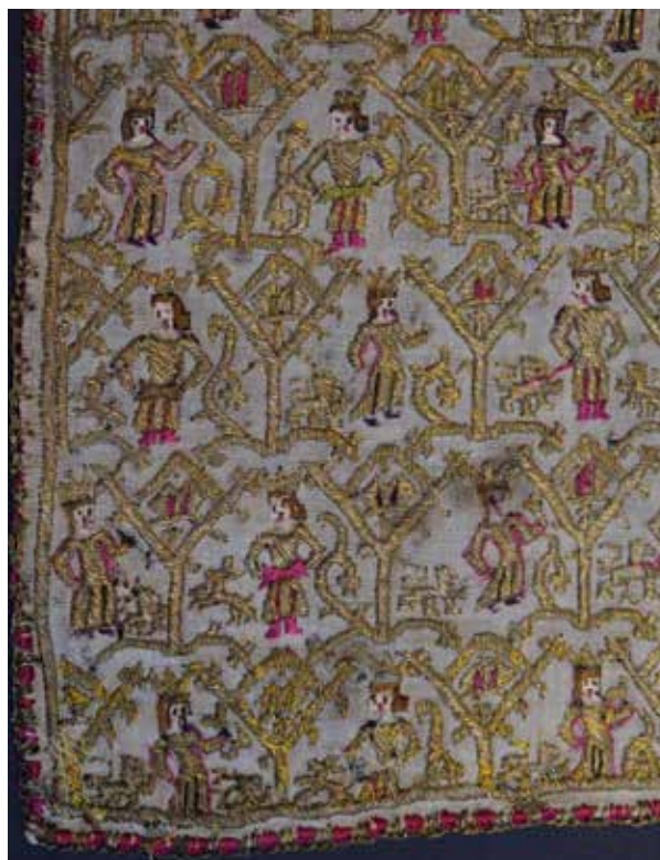
Above: Detail of the heavily embroidered section of the so-called 'Queen's Veil', showing the simplified hunting scene set in a forest (figures of Kings and Queens are approximately 3cm high); the initial "m" (for Mary) is embroidered in the centre of each of the Y-shaped tree tops.