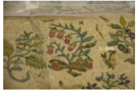
A view of the back of the fabric shows the vivid original colours of the silk embroidery threads, in contrast with the faded top surface.

Embroidering separate slips meant that, as frequently happened, they could be carefully removed from their finished garments when they became unfashionable, or when the wearer desired a change, and both the garment and the embroidery could be preserved and reused to create other items. This process was often repeated, again and again, making the most frugal use possible of each piece of work. It also widened the margin for error: if you messed up one slip, it didn't matter! You could re-do it on another frame, and only apply the successful work to the final garment. Sewing directly on to any large piece of fabric, especially a delicate or expensive one like this, completely removed all these advantages, and meant that any mistake was permanent. In embroidery like that of the Bacton Altar Cloth, worked directly onto silver chamblet, which was a fabric of the utmost value, containing real silver metal threads woven into the cloth itself, both the composition and positioning of every single motif had to be perfect first time: or else the work would be spoiled, at huge expense. This technique also meant the embroidery could never be unpicked and re-used, so owning something that had been made in this way was a very clear demonstration of riches. Only the very wealthy could afford to produce and wear garments like this one: of the most valuable materials, professionally constructed, and which could not be easily recycled.