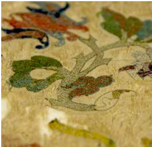
This close-up shows the ink lines of the drawn design, uncovered by stitches. An interesting omission: Why was this section left un-covered?

Another possible sign of the professionalism of this work, and perhaps the most interesting one, is that instead of employing the more erasable technique of 'pricking and pouncing' (using charcoal dust and a paper pattern to transfer the design to the fabric through pin-pricked holes), the craftsman who created the floral embroidery on the Bacton Altar Cloth has drawn the design directly onto the fabric, prior to its being picked out in stitches, with ink: using a pen or fine brush. This technique speaks to the skill and craftsmanship of its maker, as such a method really does not allow for any mistakes, and on an expensive fabric like this suggests the work of someone very confident of their art. In fact, in some parts of the embroidery, (shown in the photo to the left), the ink lines themselves seem to have been deliberately left uncovered by stitches. This, although it might at first seem like a mistake, may really have been an intentional omission, which would have allowed a knowledgeable viewer of the finished product, or fellow craftsman, to observe this evidence of skill – possibly an additional bit of showing off, to add to the conspicuous luxury and craftsmanship of the whole! In either case, and all in all, the workmanship on this amazing bit of textile is really astonishing, and very interesting to witness up close.