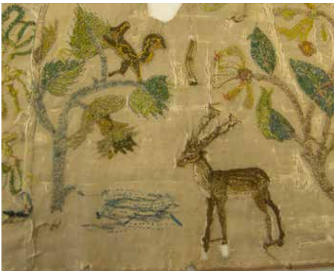
A comparison of the workmanship on the back of this deer, (also to be found in the Animalium Quadrapedum ), with the floral embroidery that surrounds it, shows the evident difference in the skill of the two different embroiderers.

Several of the embroidery motifs seem to have been inspired by particular images from a variety of contemporary illustrated texts from the period, but in particular one or two direct copies have been discovered. One is a bear, from Nicolaes de Bruyn's Animalium Quadrapedum , and the other a deer, from the same text. Interestingly, it seems clear that more than one layer of work makes up the embroidery design on the Bacton Altar Cloth. The first, a series of floral motifs, probably created during the final decade of the 16th century, is almost certainly the product of a professional hand, and is of the highest quality. The second, in which another (most likely amateur embroiderer) has filled in the ground of the design with additional motifs, like the bear and deer mentioned above, appears to have been added some years later. This, second, layer of work also features several narrative scenes picked out in miniature motifs. There is a story following the exploits of some fishermen, who run afoul of a sea monster. It seems likely that this story continues after it is chopped off by this seam – some more appears around the corner of the altar cloth, where another piece from the